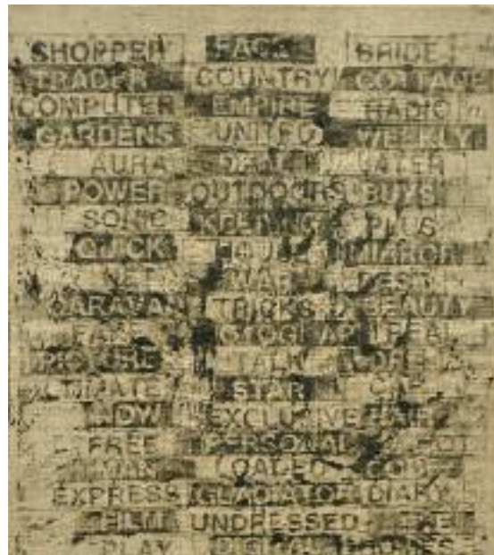
Shopper Face 2000, acrylic + oilbar on canvas 35.5 x 30.5 cm