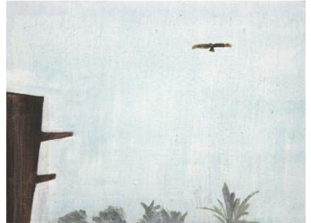
Bird 2014, oil and acrylic on board 30 x 40cm