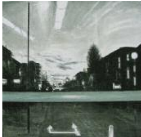
The insubstantial man oil on canvas 50 x 50 cm