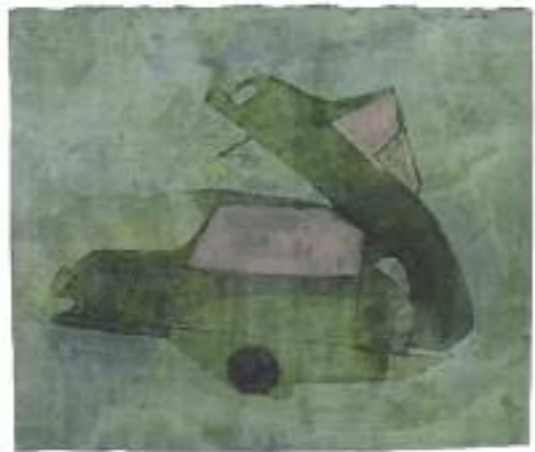
My childhood home 2014, gouache on rice paper 24 x 30cm