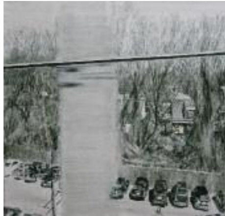
Void oil on linen 50 x 50 cm