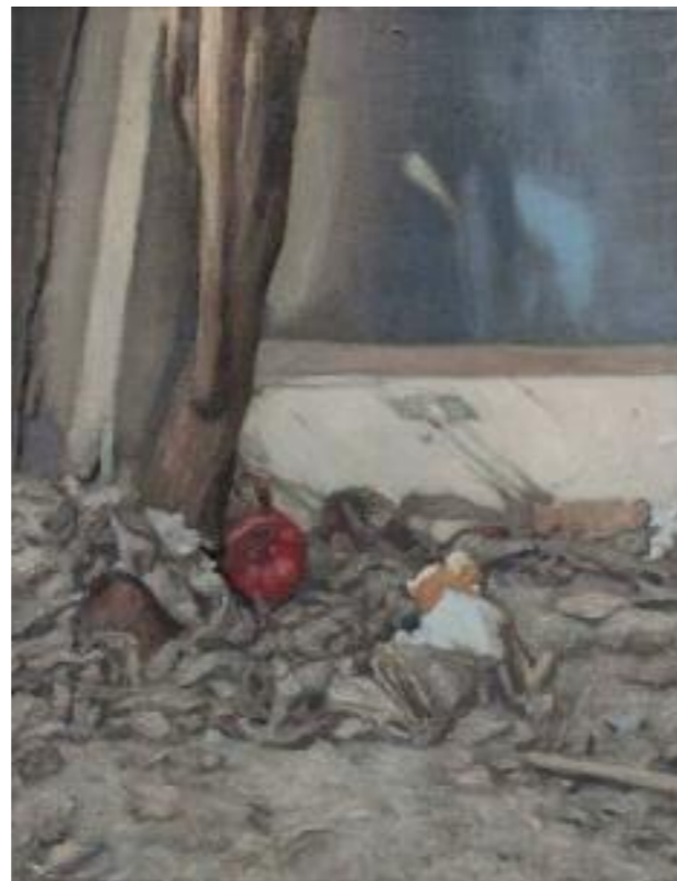
Core 2014, oil & oil pastel on linen 51 x 40 cm