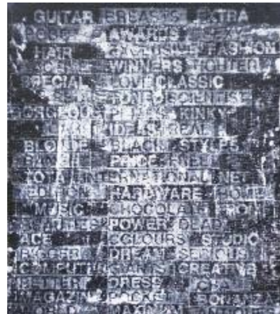
Guitar Breasts 2001, acrylic + oilbar on canvas 35.5 x 30.5 cm