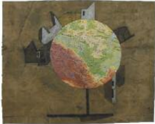
Ghosts 2014, gouache on rice paper 24 x 30cm